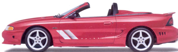
S281 Speedster, shown in Rio Red Tinted Clearcoat.