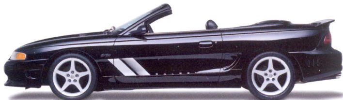
S281 Convertible, shown in Black Clearcoat.