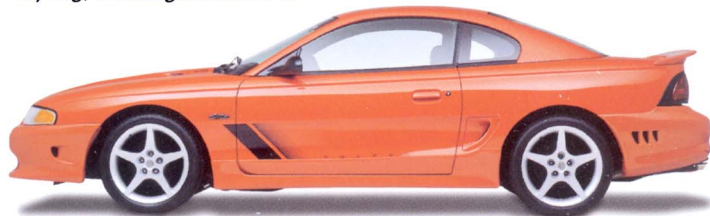
S281 Coupe, shown in Bright Tangerine Clearcoat.

The new Saleen S281 Mustang is designed to fulfill every expectation of discerning motorists who understand and appreciate what a true high performance automobile should be.