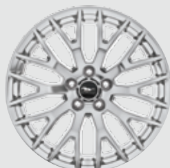
19" x 9" Front/19" x 9.5" Rear Luster Nickel-Painted Aluminum Optional: GT Performance Package