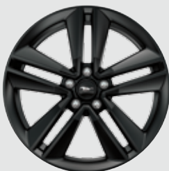
19" Ebony Black-Painted Aluminum Included: EcoBoost Performance Package