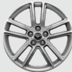
19" Polished Aluminum Included: EcoBoost Premium Pony Package