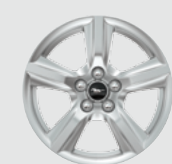
17" Sparkle Silver-Painted Aluminum Standard: V6