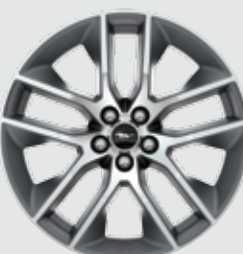
20" x 9" Foundry Black-Painted Machined Aluminum Optional: EcoBoost Premium, and GT Premium

Brakes – 4-wheel vented disc Anti-Lock Brake System (ABS)