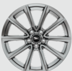
19" Dark Stainless Premium Painted Aluminum Optional: GT Premium