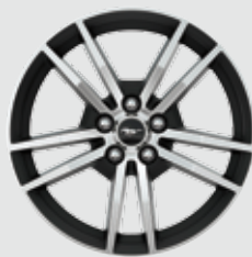
18" Magnetic-Painted Machined Aluminum Standard: EcoBoost,® EcoBoost Premium, GT and GT Premium