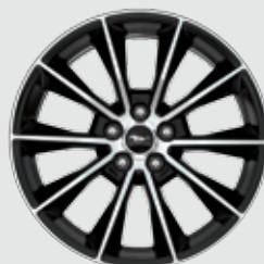
19" Low-Gloss Black-Painted Machined Aluminum Included: EcoBoost Interior & Wheel Package and Wheel & Stripe Package, and GT Interior & Wheel Package