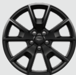
19" Ebony Black-Painted Aluminum Included: GT Black Accent Package