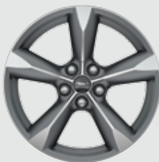
18" Foundry Black-Painted Machined Aluminum Included: V6 051A Optional: EcoBoost, EcoBoost Premium, GT and GT Premium