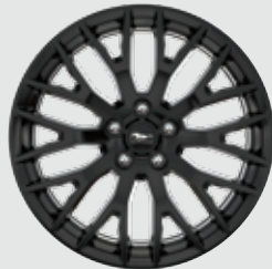
19" x 9" Front/19" x 9.5" Rear Ebony Black-Painted Aluminum Included: GT Performance Package