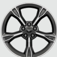
19" Ebony Black-Painted Machined Aluminum Included: GT Premium California Special